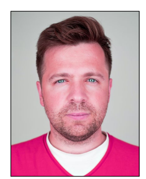
Unnatural skin tones

Note: Head coverings are only permitted for religious reasons.